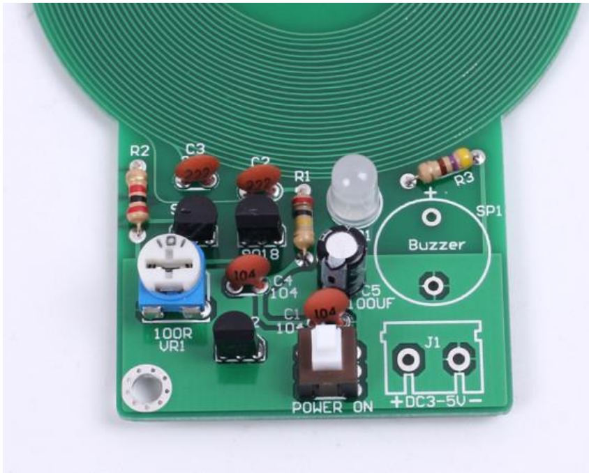
Step 5: Install Buzzer and Power socket.